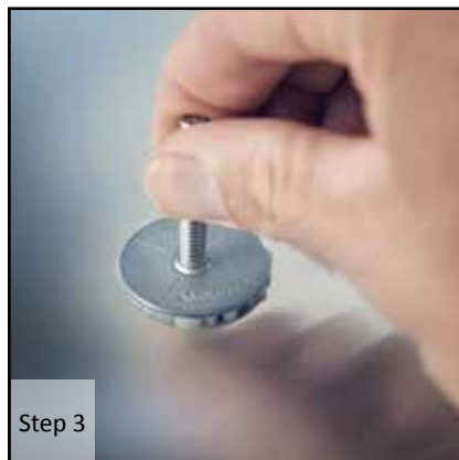
Step 3 Push part into the substrate to squeeze adhesive out from base.