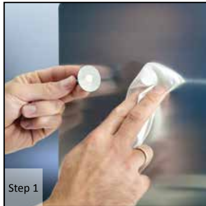
Step 1 Clean fastener and substrate with scotchbrite and solvent.