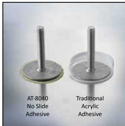
AT-8040 No Slide Adhesive