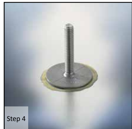
Step 4 Slowly turn part clockwise while pushing until it won't turn.