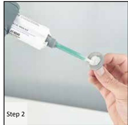
Step 2 Put a large drop of adhesive in the center of the part base.